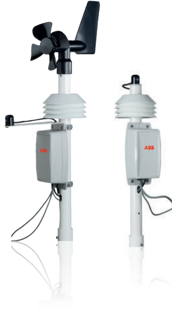
ABB monitoring and communications VSN800 Weather Station

The VSN800 Weather Station automatically monitors site meteorological conditions and photovoltaic panel temperature in real-time, transmitting sensor measurements to the Aurora Vision® Plant Management Platform.